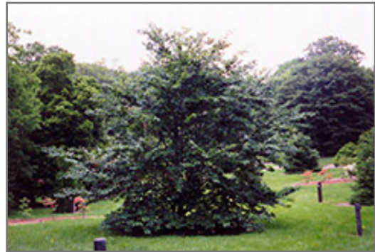
American Beech