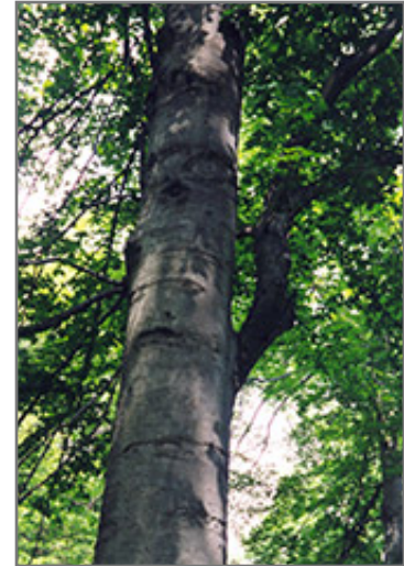
American Beech bark

This tree should only be grown in full sunlight. It requires an evenly moist well-drained soil for optimal growth, but will die in standing water. It is not particular as to soil pH, but grows best in rich soils. It is quite intolerant of urban pollution, therefore inner city or urban streetside plantings are best avoided, and will benefit from being planted in a relatively sheltered location. This species is native to parts of North America.