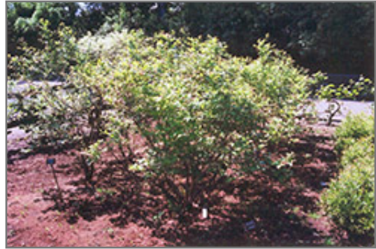
Northland Blueberry

This shrub does best in full sun to partial shade. It does best in average to evenly moist conditions, but will not tolerate standing water. It is very fussy about its soil conditions and must have sandy, acidic soils to ensure success, and is subject to chlorosis (yellowing) of the leaves in alkaline soils. It is quite intolerant of urban pollution, therefore inner city or urban streetside plantings are best avoided, and will benefit from being planted in a relatively sheltered location. Consider applying a thick mulch around the root zone in winter to protect it in exposed locations or colder microclimates. This is a selection of a native North American species.