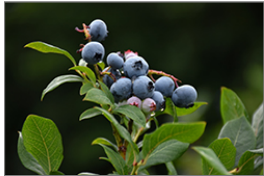
Northland Blueberry fruit