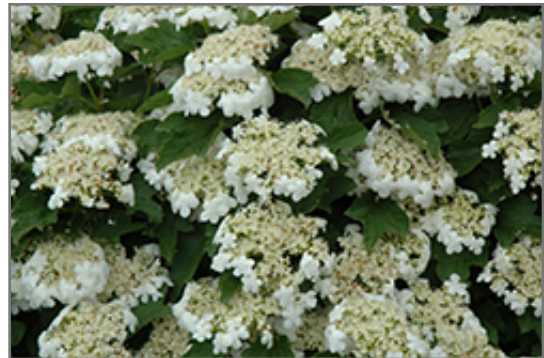
Compact European Cranberry flowers