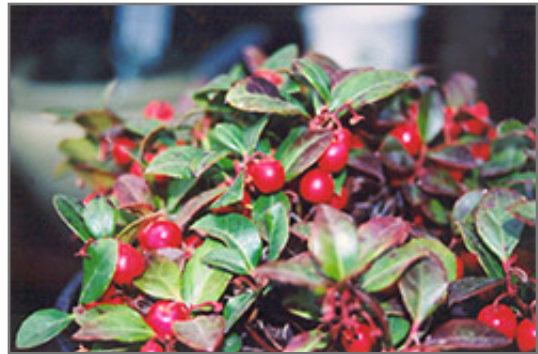
Creeping Wintergreen fruit