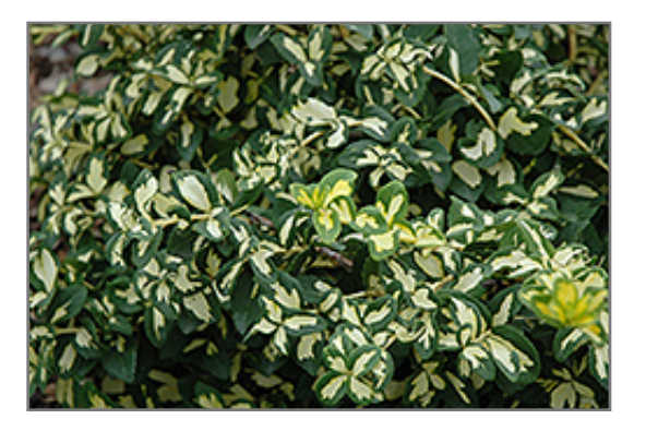
Moonshadow Wintercreeper foliage