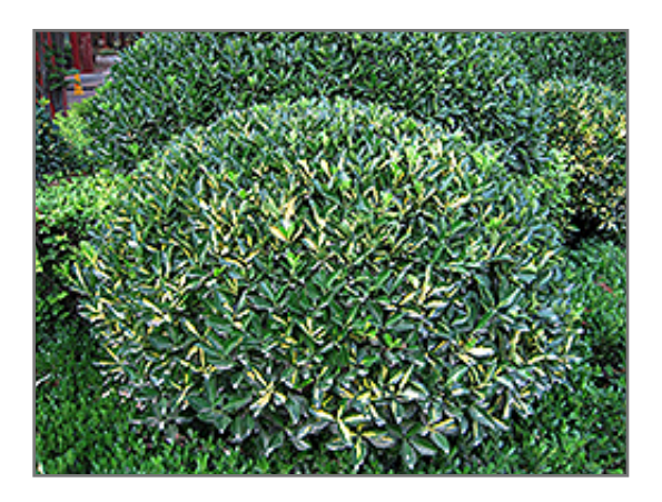
Moonshadow Wintercreeper