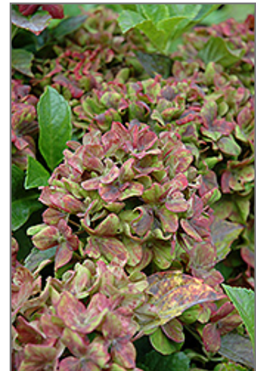
Pistachio Hydrangea flowers