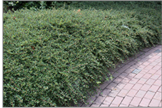
Coral Beauty Cotoneaster