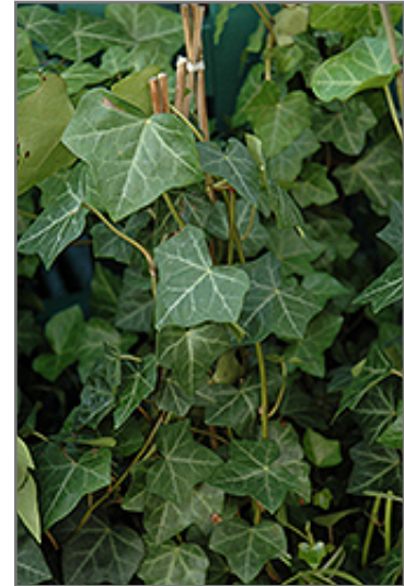
Thorndale Ivy foliage