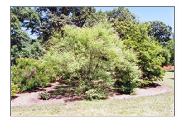
Chaste Tree

Columbus Garden Center - 1156 Oakland Park Avenue, Columbus, OH 43224-3317 Phone: 614-268-3511 Fax: 614-784-7700 Delaware Garden Center - 25 Kilbourne Road, Delaware, OH 43015 Phone: 740-548-6633 Fax: 740-363-2091 Dublin Garden Center - 4261 West Dublin-Granville Road, Dublin, Ohio 43017 Phone: 614-874-2400 Fax: 614-874-2420 New Albany Garden Center - 5211 Johnstown Rd, New Albany, Ohio 43054 Phone: 614-917-1020 Fax: 614-917-1023