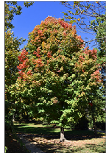
Endowment Sugar Maple