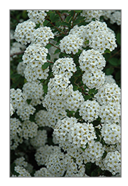
Renaissance Spirea flowers

Columbus Garden Center - 1156 Oakland Park Avenue, Columbus, OH 43224-3317 Phone: 614-268-3511 Fax: 614-784-7700 Delaware Garden Center - 25 Kilbourne Road, Delaware, OH 43015 Phone: 740-548-6633 Fax: 740-363-2091 Dublin Garden Center - 4261 West Dublin-Granville Road, Dublin, Ohio 43017 Phone: 614-874-2400 Fax: 614-874-2420 New Albany Garden Center - 5211 Johnstown Rd, New Albany, Ohio 43054 Phone: 614-917-1020 Fax: 614-917-1023