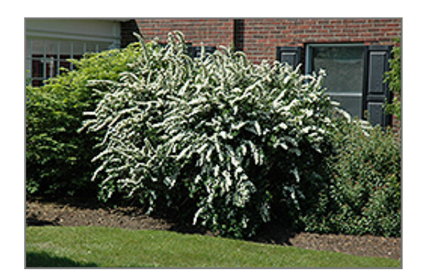
Renaissance Spirea in bloom