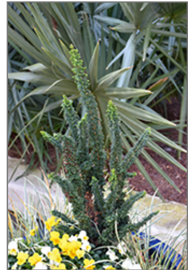
Chirimen Hinoki Falsecypress

Chirimen Hinoki Falsecypress makes a fine choice for the outdoor landscape, but it is also well-suited for use in outdoor pots and containers. With its upright habit of growth, it is best suited for use as a 'thriller' in the 'spiller-thriller-filler' container combination; plant it near the center of the pot, surrounded by smaller plants and those that spill over the edges. Note that when grown in a container, it may not perform exactly as indicated on the tag - this is to be expected. Also note that when growing plants in outdoor containers and baskets, they may require more frequent waterings than they would in the yard or garden.