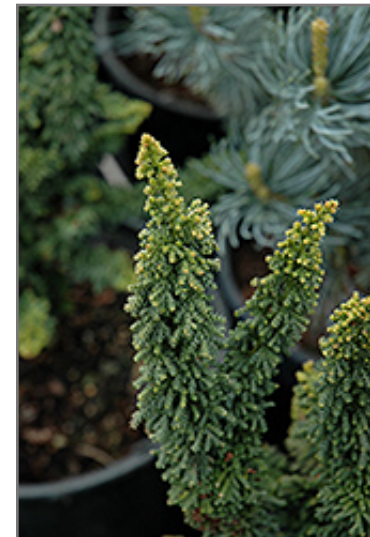
Chirimen Hinoki Falsecypress foliage