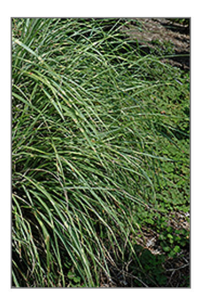
Little Zebra Dwarf Maiden Grass foliage