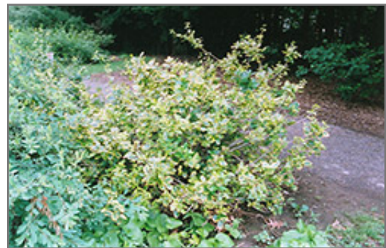
E.T. Gold Wintercreeper