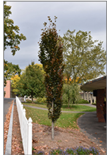
Dawyck Purple Beech