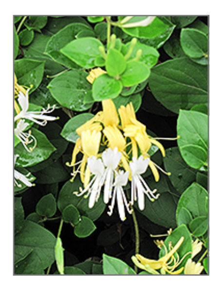
Hall's Japanese Honeysuckle flowers