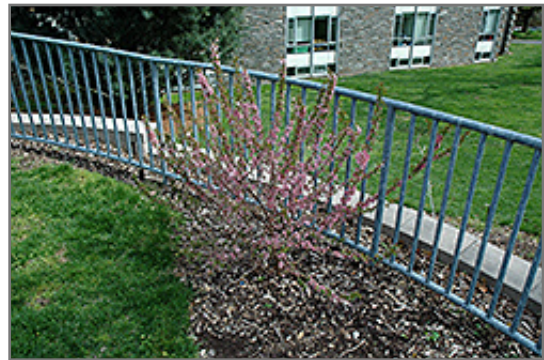
Dwarf Bush Cherry in bloom