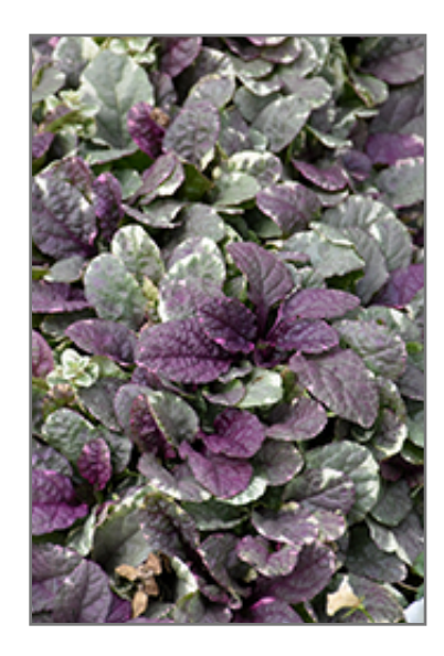
Burgundy Glow Bugleweed foliage