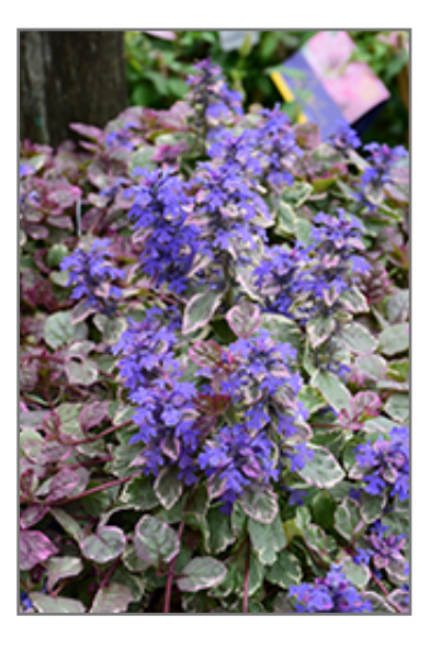
Burgundy Glow Bugleweed flowers

Burgundy Glow Bugleweed is a dense herbaceous evergreen perennial with a ground-hugging habit of growth. Its medium texture blends into the garden, but can always be balanced by a couple of finer or coarser plants for an effective composition.