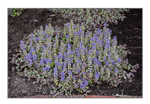
Burgundy Glow Bugleweed in bloom

Burgundy Glow Bugleweed is a fine choice for the garden, but it is also a good selection for planting in outdoor containers and hanging baskets. Because of its spreading habit of growth, it is ideally suited for use as a 'spiller' in the 'spiller-thriller-filler' container combination; plant it near the edges where it can spill gracefully over the pot. Note that when growing plants in outdoor containers and baskets, they may require more frequent waterings than they would in the yard or garden.