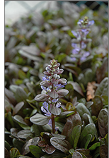
Chocolate Chip Bugleweed flowers