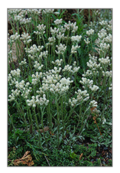
Pussytoes in bloom