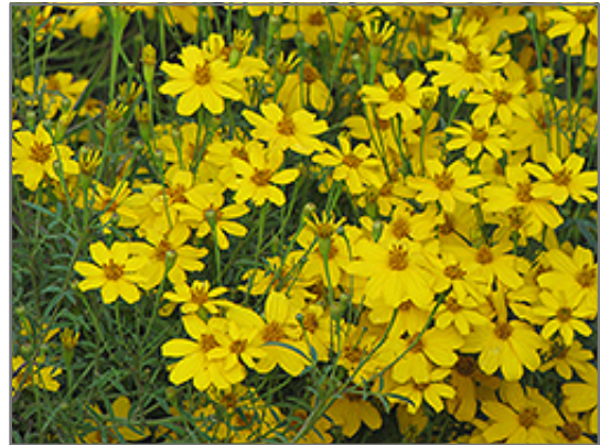
Zagreb Tickseed flowers