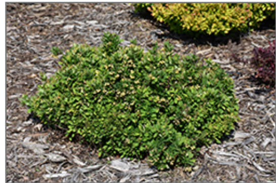
Moscato Barberry