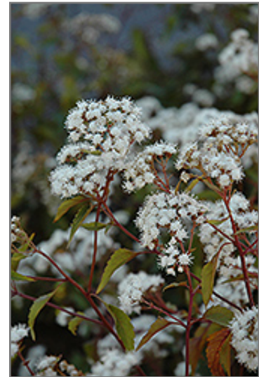
Chocolate Boneset flowers

Chocolate Boneset is recommended for the following landscape applications;