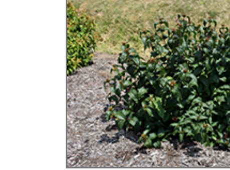
Kodiak Black Diervilla

This shrub will require occasional maintenance and upkeep, and is best pruned in late winter once the threat of extreme cold has passed. It is a good choice for attracting butterflies and hummingbirds to your yard. Gardeners should be aware of the following characteristic(s) that may warrant special consideration;