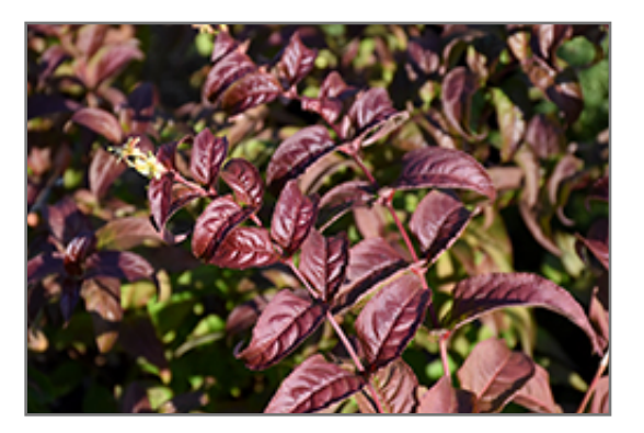
Kodiak Black Diervilla foliage

Kodiak Black Diervilla will grow to be about 4 feet tall at maturity, with a spread of 4 feet. It tends to fill out right to the ground and therefore doesn't necessarily require facer plants in front. It grows at a medium rate, and under ideal conditions can be expected to live for approximately 20 years.