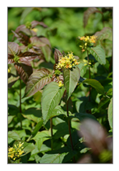
Kodiak Black Diervilla flowers