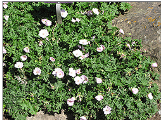
Striated Cranesbill in bloom