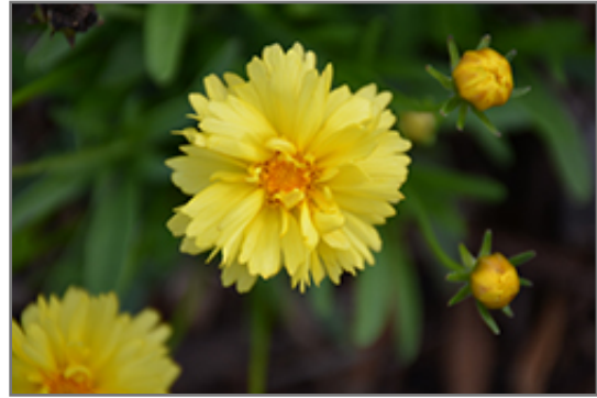
Leading Lady Charlize Tickseed flowers

Leading Lady Charlize Tickseed is recommended for the following landscape applications;