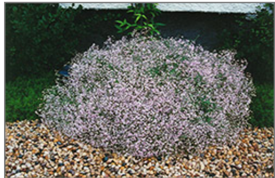
Pink Fairy Baby's Breath in bloom