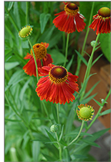
Moerheim Beauty Sneezeweed flowers