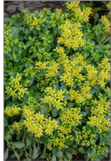
Little Miss Sunshine Stonecrop flowers

Little Miss Sunshine Stonecrop is recommended for the following landscape applications;