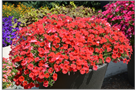
Supertunia Really Red Petunia in bloom

Supertunia Really Red Petunia is a fine choice for the garden, but it is also a good selection for planting in outdoor containers and hanging baskets. Because of its trailing habit of growth, it is ideally suited for use as a 'spiller' in the 'spiller-thriller-filler' container combination; plant it near the edges where it can spill gracefully over the pot. Note that when growing plants in outdoor containers and baskets, they may require more frequent waterings than they would in the yard or garden.