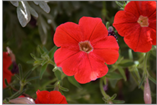
Supertunia Really Red Petunia flowers

This plant will require occasional maintenance and upkeep. Trim off the flower heads after they fade and die to encourage more blooms late into the season. It is a good choice for attracting butterflies and hummingbirds to your yard, but is not particularly attractive to deer who tend to leave it alone in favor of tastier treats. It has no significant negative characteristics.