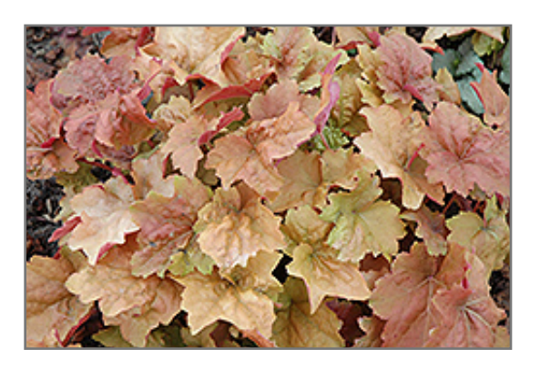
Dolce Creme Brulee Coral Bells foliage