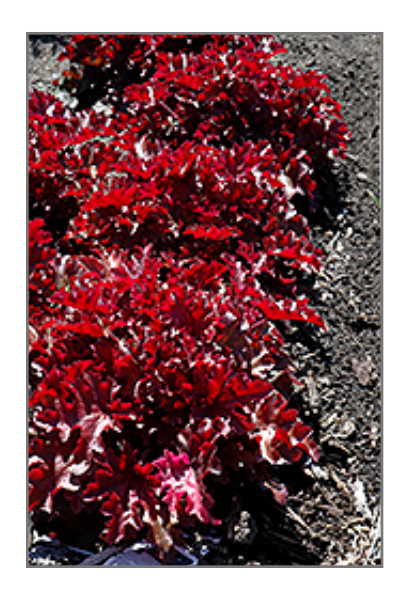
Dolce Creme Brulee Coral Bells