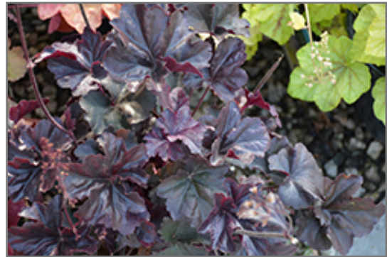
Obsidian Coral Bells foliage

Obsidian Coral Bells is recommended for the following landscape applications;