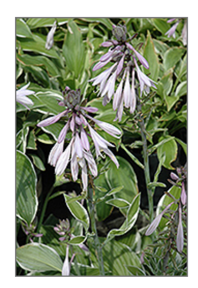
Francee Hosta flowers