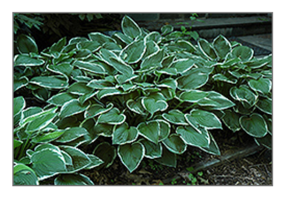
Francee Hosta