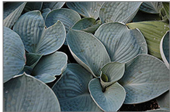
Love Pat Hosta foliage