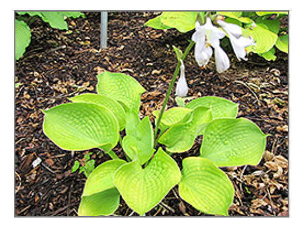
Midas Touch Hosta