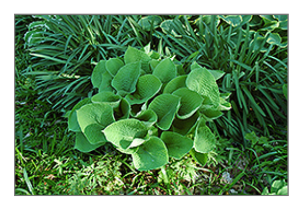
Midas Touch Hosta