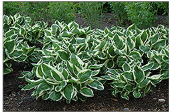
Minuteman Hosta