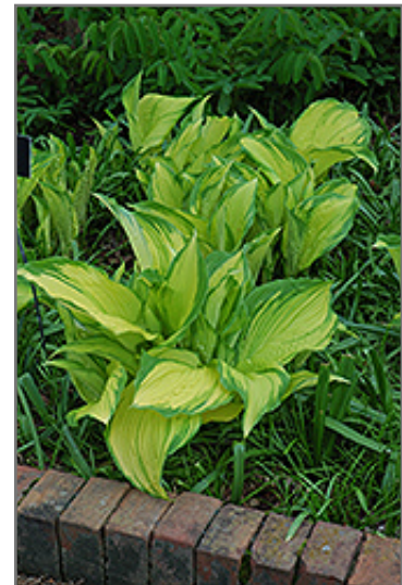
On Stage Hosta