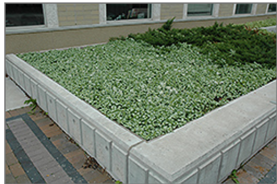
White Nancy Spotted Dead Nettle in bloom