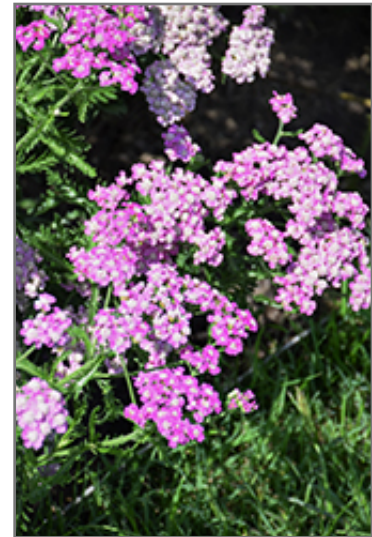
Firefly Amethyst Yarrow flowers

Firefly Amethyst Yarrow is recommended for the following landscape applications;