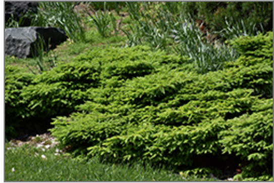
Little Gem Spruce

This shrub does best in full sun to partial shade. It does best in average to evenly moist conditions, but will not tolerate standing water. It is not particular as to soil type or pH, and is able to handle environmental salt. It is highly tolerant of urban pollution and will even thrive in inner city environments. This is a selected variety of a species not originally from North America.