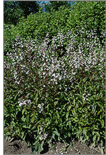
Husker Red Beard Tongue in bloom

Husker Red Beard Tongue is a fine choice for the garden, but it is also a good selection for planting in outdoor pots and containers. With its upright habit of growth, it is best suited for use as a 'thriller' in the 'spiller-thriller-filler' container combination; plant it near the center of the pot, surrounded by smaller plants and those that spill over the edges. Note that when growing plants in outdoor containers and baskets, they may require more frequent waterings than they would in the yard or garden.