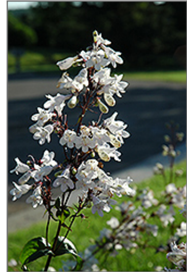
Husker Red Beard Tongue flowers