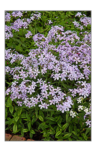
Woodland Phlox flowers

Woodland Phlox will grow to be about 8 inches tall at maturity, with a spread of 18 inches. When grown in masses or used as a bedding plant, individual plants should be spaced approximately 16 inches apart. Its foliage tends to remain low and dense right to the ground. It grows at a medium rate, and under ideal conditions can be expected to live for approximately 10 years. As an herbaceous perennial, this plant will usually die back to the crown each winter, and will regrow from the base each spring. Be careful not to disturb the crown in late winter when it may not be readily seen!