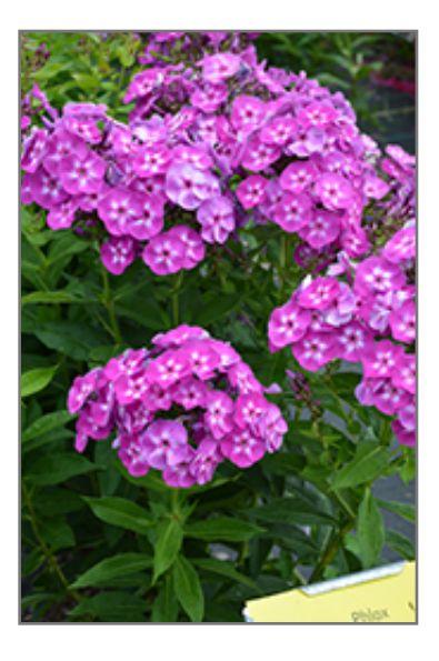
Laura Garden Phlox flowers

Laura Garden Phlox features bold fragrant conical lilac purple star-shaped flowers with white eyes at the ends of the stems from early summer to early fall. The flowers are excellent for cutting. Its narrow leaves remain green in color throughout the season.