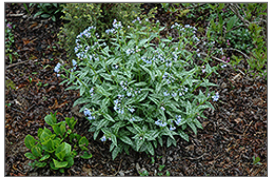
Roy Davidson Lungwort in bloom