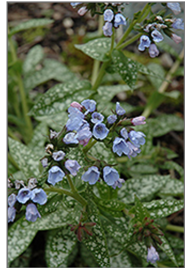
Roy Davidson Lungwort flowers