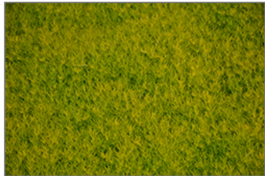
Scotch Moss foliage