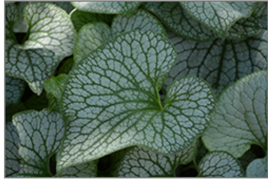
Sterling Silver Bugloss foliage

Sterling Silver Bugloss will grow to be about 12 inches tall at maturity, with a spread of 24 inches. When grown in masses or used as a bedding plant, individual plants should be spaced approximately 20 inches apart. It grows at a medium rate, and under ideal conditions can be expected to live for approximately 10 years. As an herbaceous perennial, this plant will usually die back to the crown each winter, and will regrow from the base each spring. Be careful not to disturb the crown in late winter when it may not be readily seen!