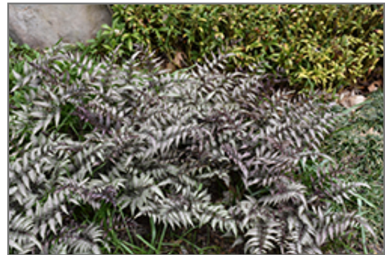
Pewter Lace Painted Fern