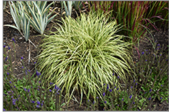
Evergold Variegated Japanese Sedge foliage

Evergold Variegated Japanese Sedge will grow to be about 8 inches tall at maturity, with a spread of 12 inches. Its foliage tends to remain low and dense right to the ground. It grows at a medium rate, and under ideal conditions can be expected to live for approximately 10 years. As an evergreen perennial, this plant will typically keep its form and foliage year-round.