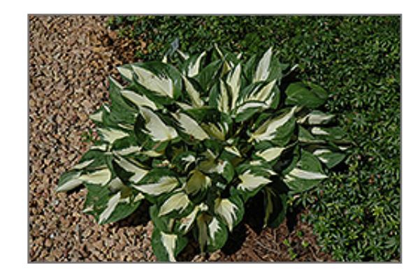
Lovalist Hosta

Loyalist Hosta is a dense herbaceous perennial with tall flower stalks held atop a low mound of foliage. Its medium texture blends into the garden, but can always be balanced by a couple of finer or coarser plants for an effective composition.