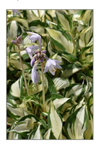
Lovalist Hosta flowers

This is a relatively low maintenance plant, and is best cleaned up in early spring before it resumes active growth for the season. Gardeners should be aware of the following characteristic(s) that may warrant special consideration;