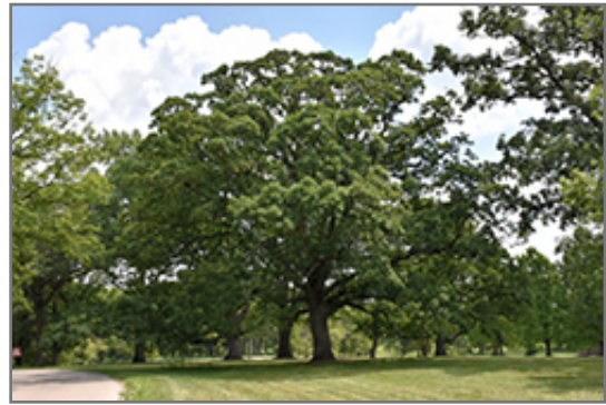
White Oak